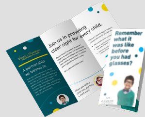
BROCHURES & BROCHURE HOLDER